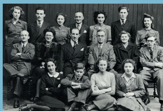
The Dutch & Dutch team in 1948

As your local property specialists with over a century of experience, we combine traditional knowledge with the latest technology to help you achieve the very best results.