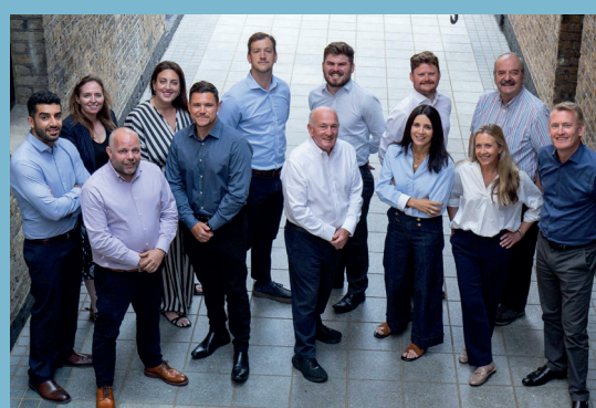
The Dutch & Dutch team current day